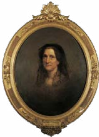
Ann Pamela Cunningham, by James Reid Lambdin, c. 1860.

M y usual enjoyable duty is to write about a Revolutionary War Loyalist, but this month I'm focusing on Ann Pamela Cunningham (1816-1875), who was born 33 years after the war ended. 1 When a horse threw her at seventeen, the talented young woman was left with lasting impairment. The family's great wealth meant she could get medical care in Philadelphia for her ongoing pain, though it wasn't enough.